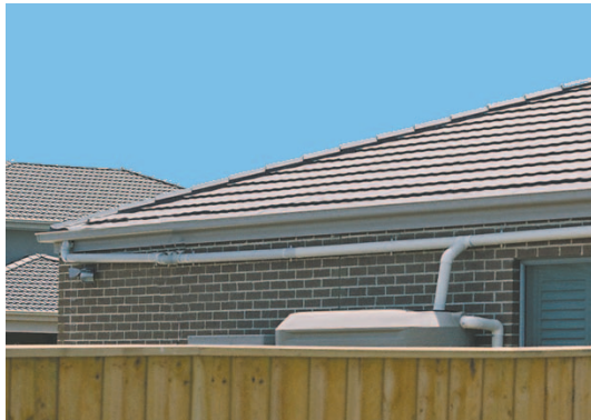
Downpipes illegally plumbed into same size downpipe