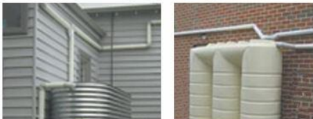
Downpipe and tank overflows must comply with plumbing regulations AS/NZS 3500.