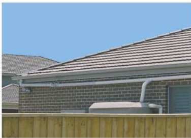
Downpipes plumbed along walls can be ugly

Capture then wash through bird droppings Overflow when fine mesh filters block